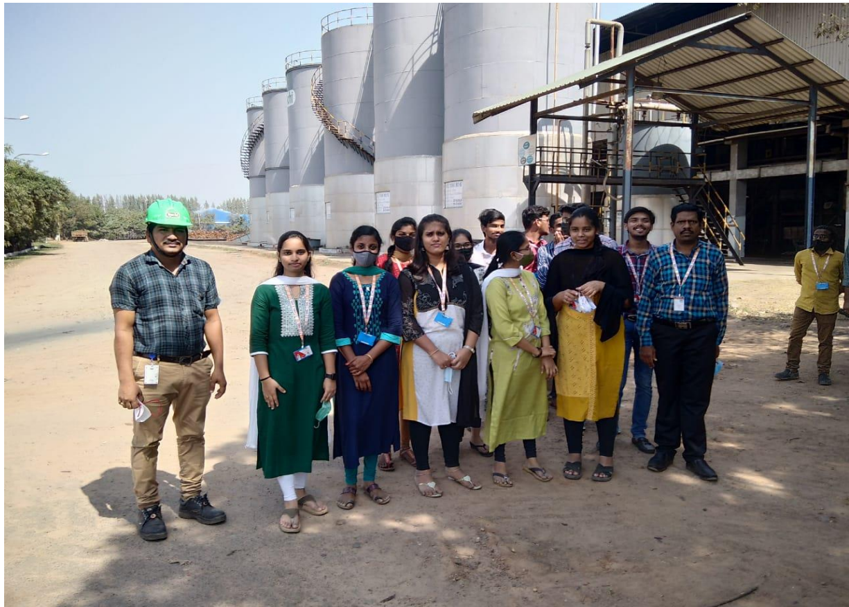
Picks of Industrial Visit