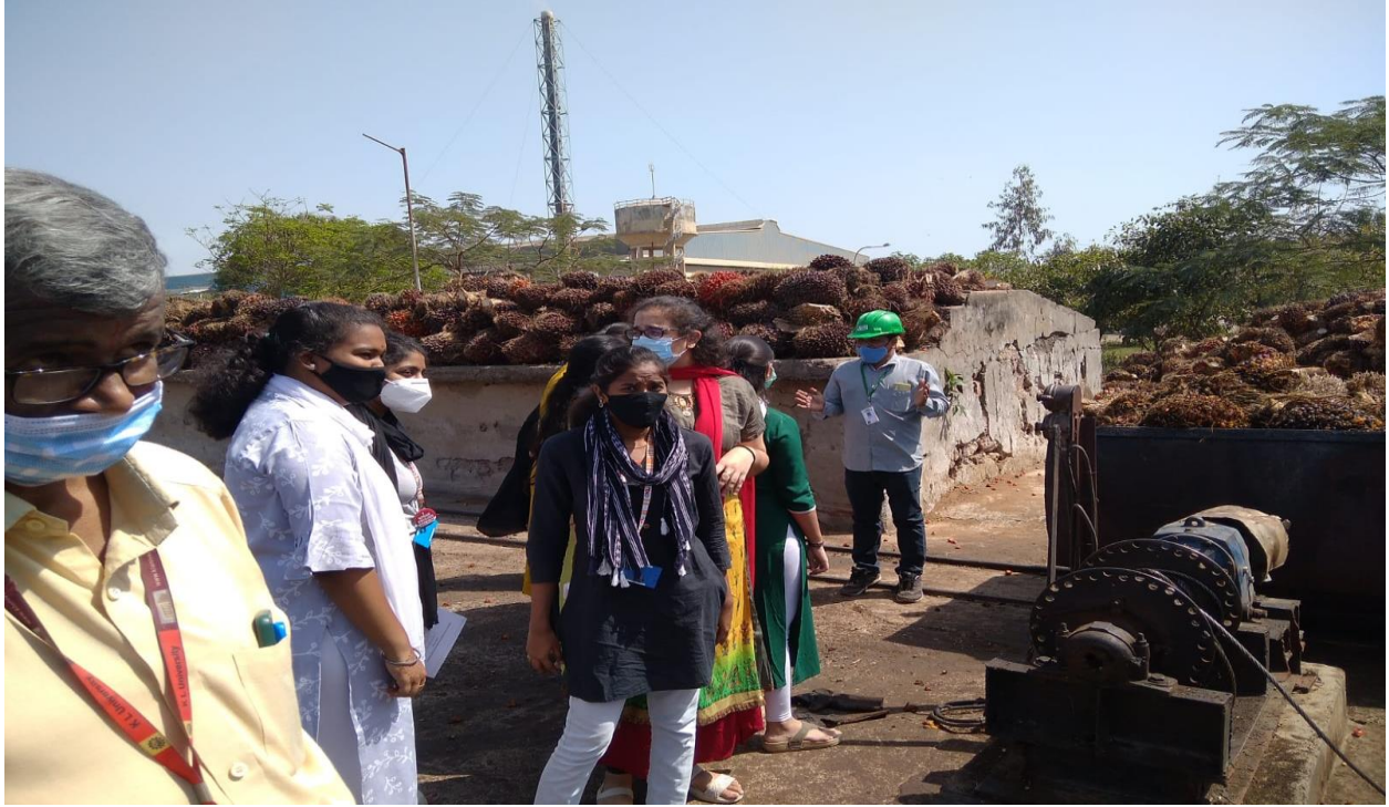
Picks of Industrial Visit